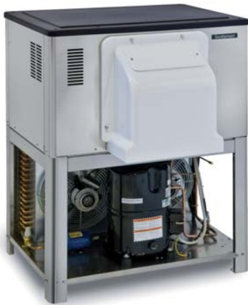
ABS Ice Chute Cover: sold separately.