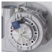
Gear box protection (hall effect)