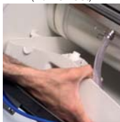
Easy to remove water sump